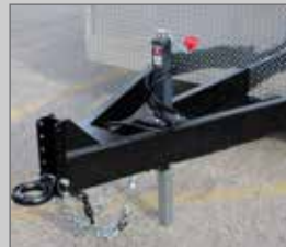
HD 54" A-FRAME WITH ROCK-GUARD COATING