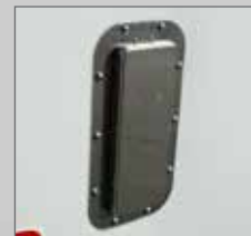
ADJUSTABLE ALUMINUM SIDEWALL VENTS