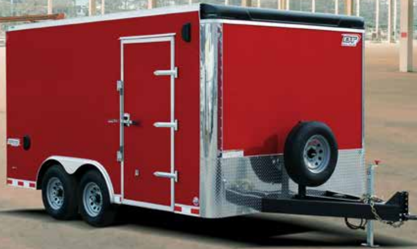
BRT8516TA3 WITH SPARE TIRE AND MOUNT