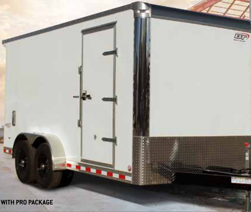
BRT716TA3 WITH PRO PACKAGE