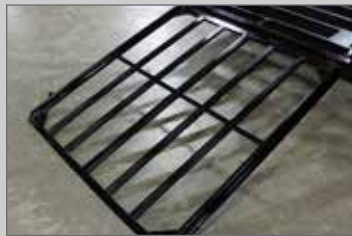
SUPER HEAVY-DUTY REAR RAMP DOOR 5500# CAPACITY, 7500# OPTIONAL