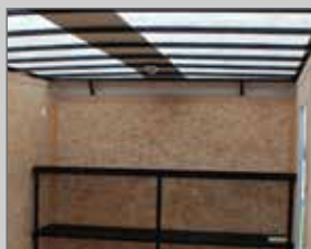
TRANSLUCENT CEILING WITH STEEL SHELIVING