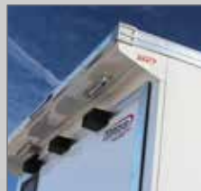
REAR WING WITH LOADING LIGHTS