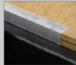
DOUBLE 3/4" WOLMANIZED PLYWOOD FLOOR