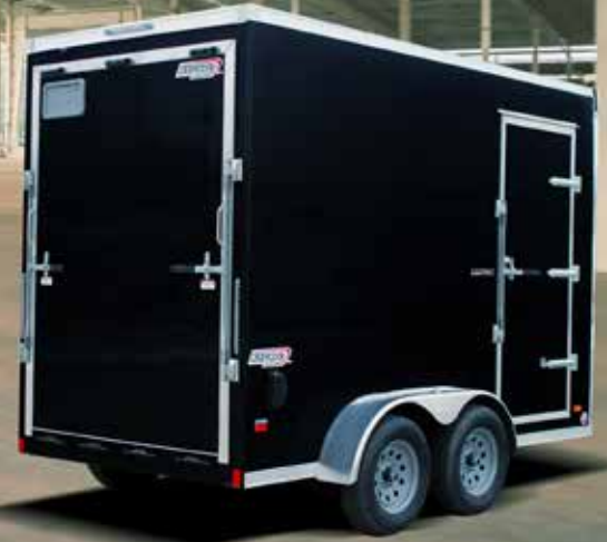
BRT612TA3 WITH EXTRA HEIGHT