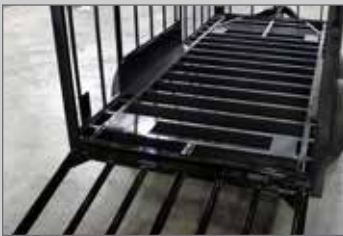
ALL TUBE REAR CORNERPOSTS, HEADER AND REAR CROSS MEMBER

TRANSPORT-SECURE-STORE BRUTE TRAILERS ARE THE REAL THING. OUR ENGINEERING TEAM HAS WORKED WITH END USERS AND FIELD TESTED THEM TO ASSURE YOU A TRAILER THAT WILL GET THE JOB DONE. BRUTE GIVES YOU THE DURABILITY YOU NEED AND OUR GREAT LOOKING TRAILERS BECOME ROLLING BILLBOARDS FOR YOUR BUSINESS!