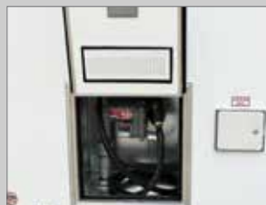
FUEL STATION WITH ACCESS DOOR AND 30-GALLON TANK