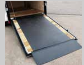
ROCKGUARD COATED STEEL TREAD PLATE ON RAMP AND REINFORCED STEEL FLAP