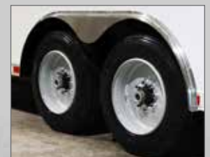
HEAVY-DUTY OPTIONS, 12K NOSE JACK AND UP TO 8K AXLES