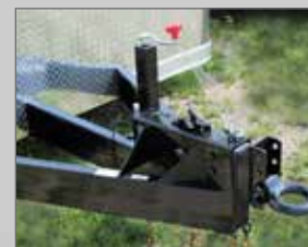
SURGE BRAKES WITH ADJUSTABLE COUPLER