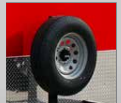
SPARE TIRE WITH FRAME MOUNT