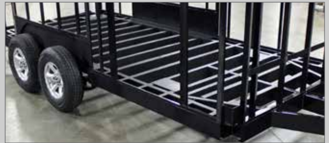
BRUTE HAS THE STRONGEST ENCLOSED TRAILER FRAME IN THE INDUSTRY!