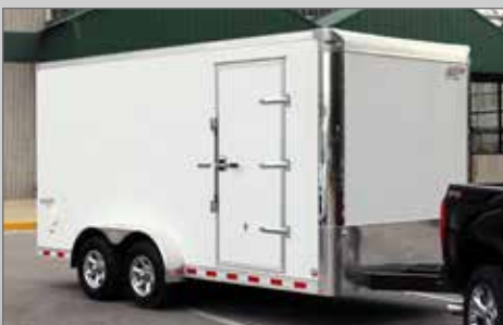
BRT716TA3 WITH OPTIONAL ALUMINUM WHEELS